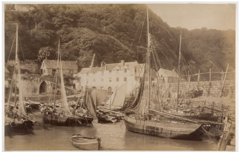
Clovelly Harbour, Clovelly, Torridge, Devon, c. 1885.

The Burton at Bideford is seeking a socially-engaged photographer to work on a project with a group of women with complex needs. The project will use Historic England's Janette Rosing Collection as a starting point.