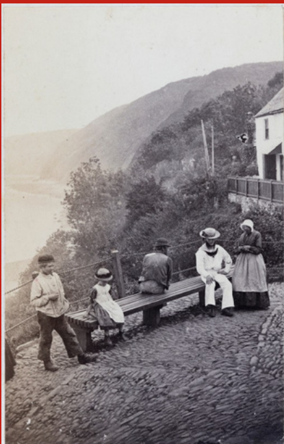
Lookout, Clovelly, Torridge, Devon, 1860